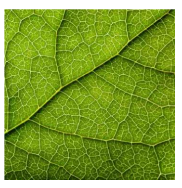
Our combined knowledge and experience allows us to provide advice, support and publicity to any public authority that wants to implement sustainable and innovation procurement.